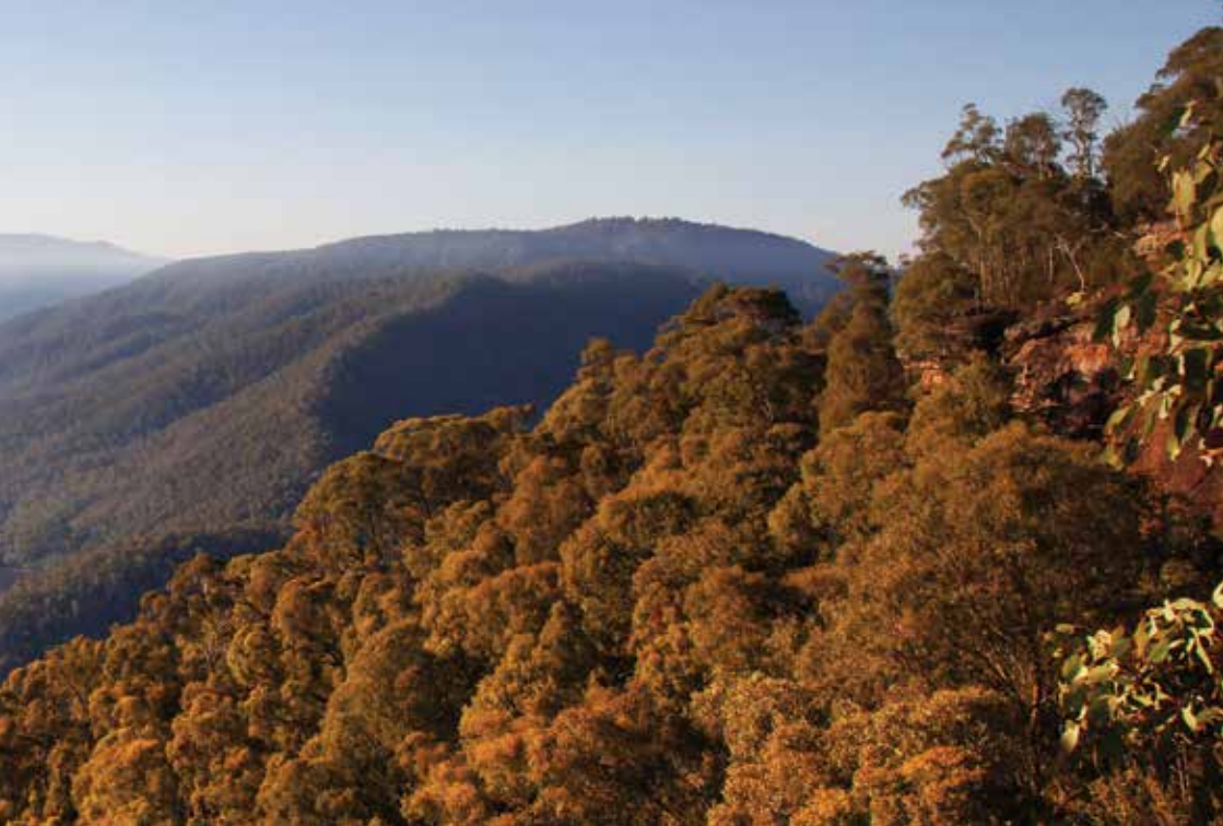
The view from Powers Lookout, King Valley.