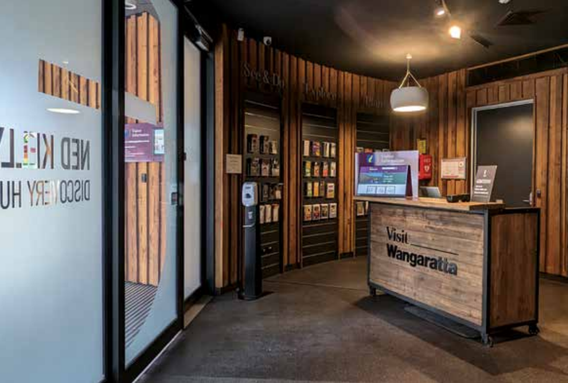
Visitor Information Centre at the Ned Kelly Discovery Hub entrance.